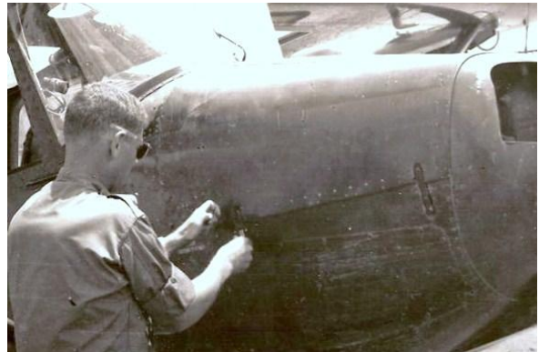
Don and Machine 2011